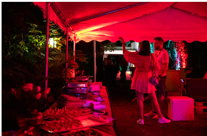
VIP area at the Polish Party