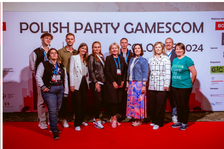
Step and Repeat printed wall at gamescom 2024